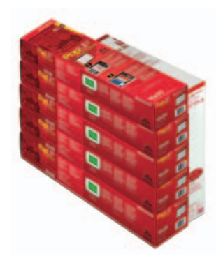
Extra Storage- Store up to five filters in the same space you used to store just one.

Extra Filtration - Unique design offers an additional 1" of filtration depth compared to standard cartridge replacement filters.